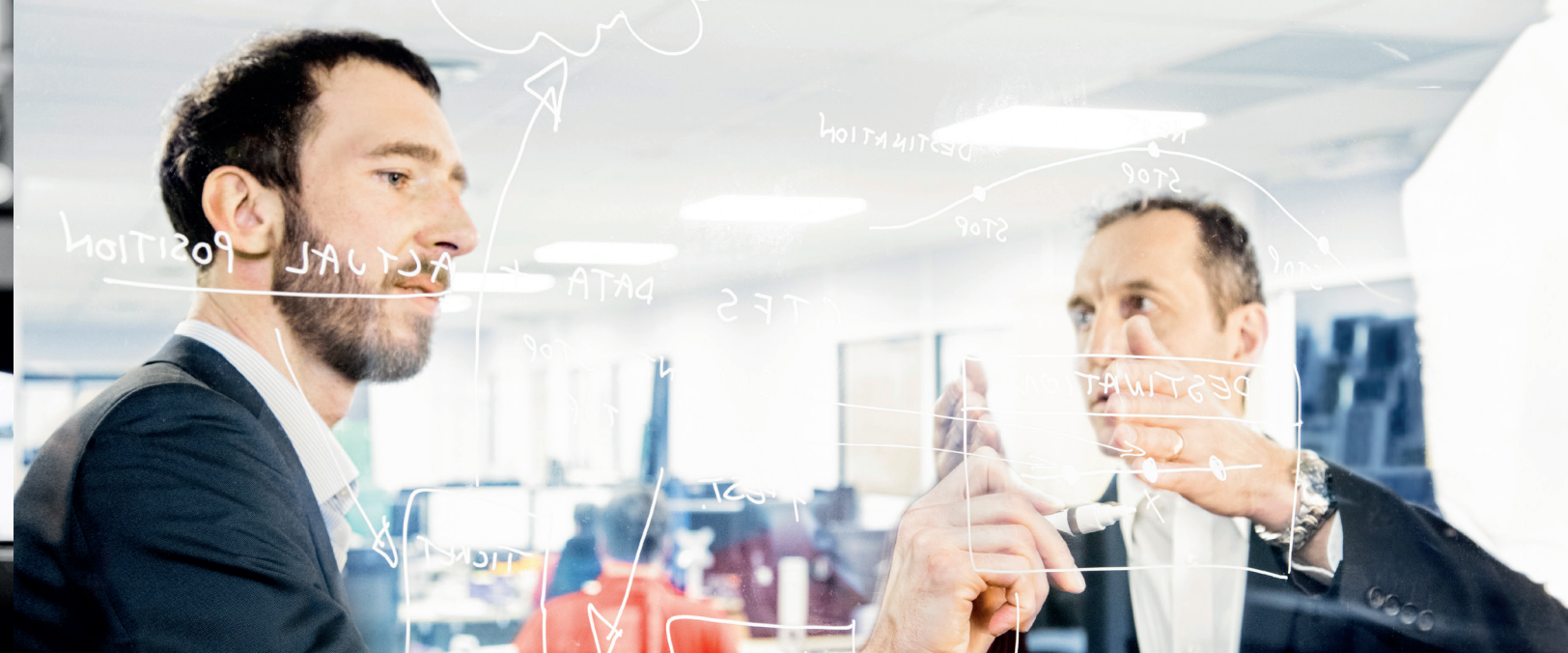
IN-HOUSE SOFTWARE DEVELOPMENT