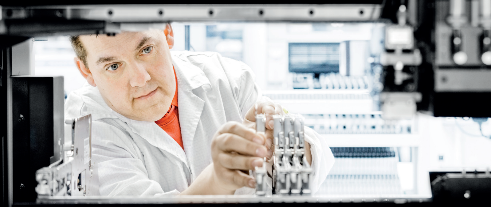
BOARD ASSEMBLY AT UNIT 25, LEWES