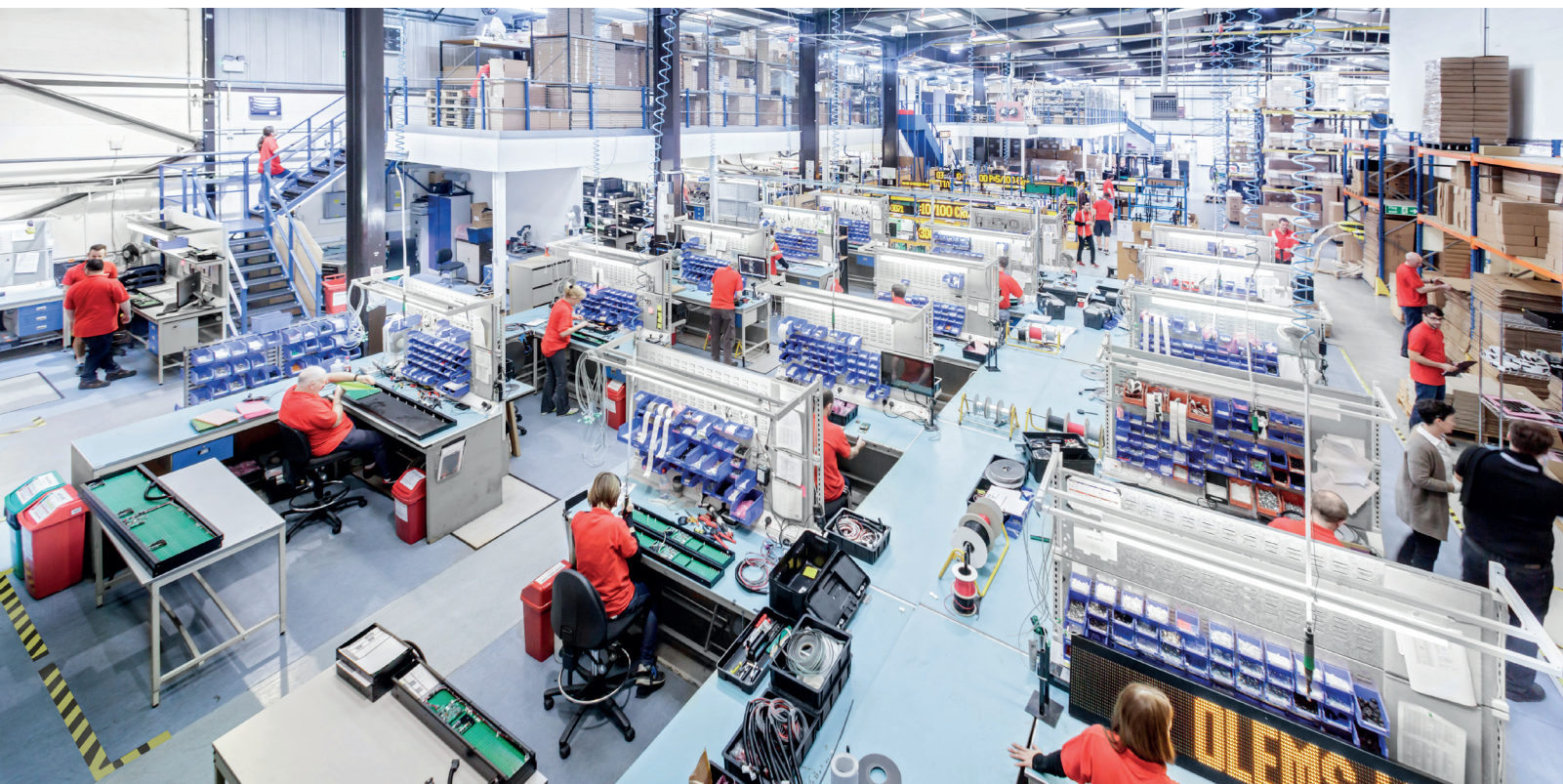
SIGN ASSEMBLY AT UNIT 24, LEWES