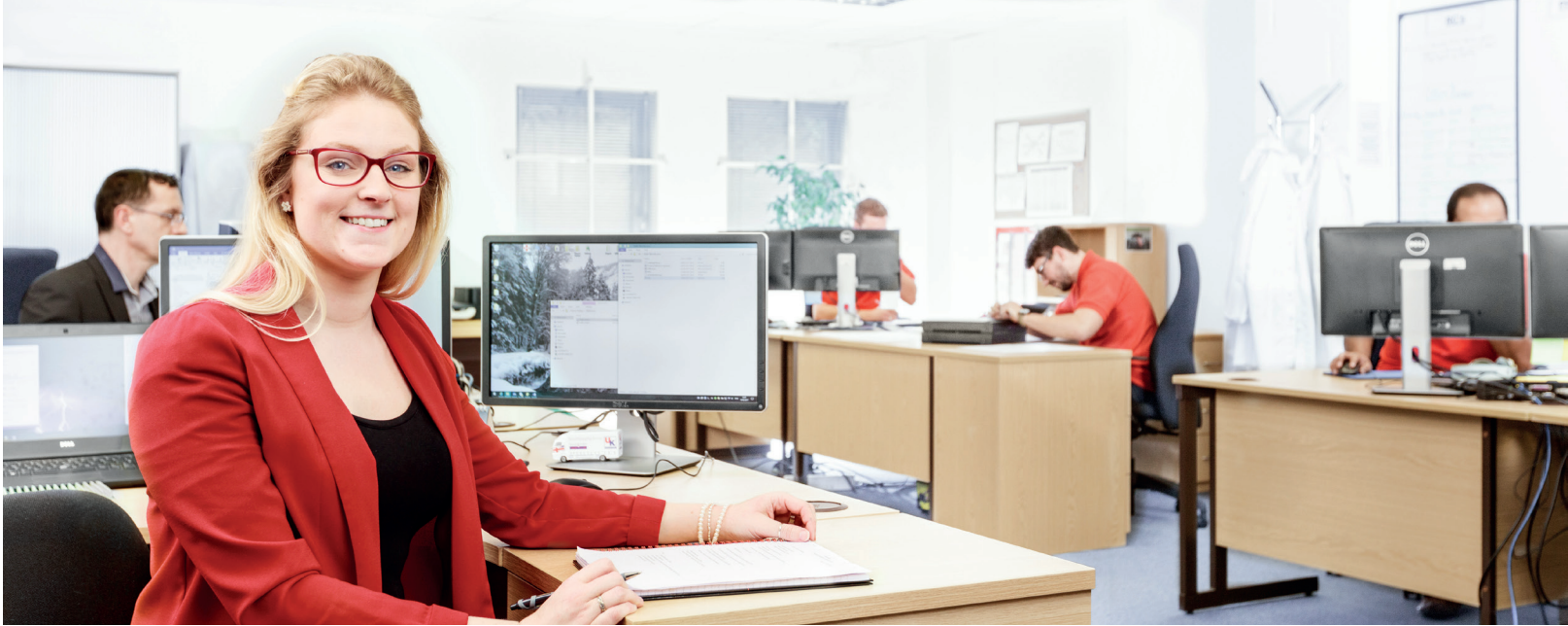
SERVICE QUALITY OFFICE UNIT 24, LEWES