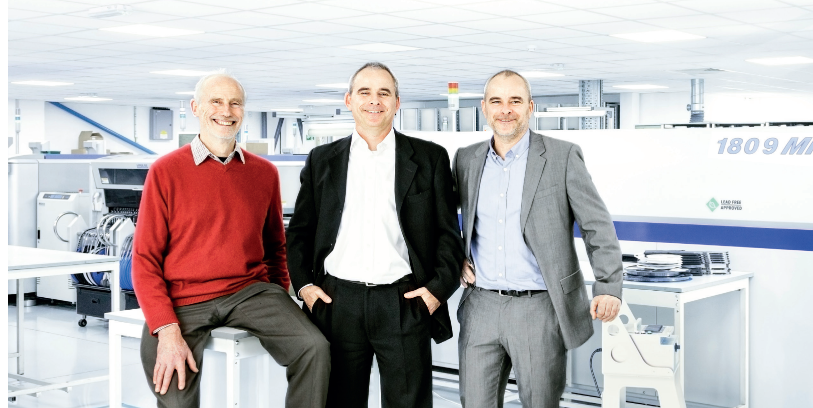
WILLIAMS FAMILY AT UNIT 25, LEWES